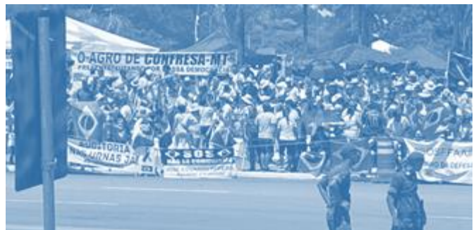
Banners of protesters in Brasília calling for an audit of the ballot boxes.

However, Bolsonaro supporters continue to protest alleging fraud in the elections even two weeks after the result. The holiday of November 15, Brazil's Independence, was another pretext for further demonstrations in the streets.